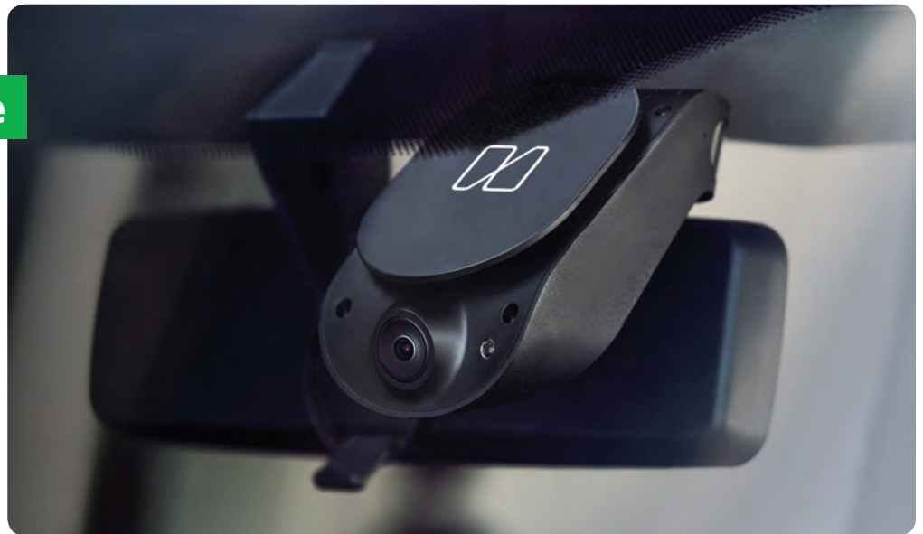
Nauto's multi-sensor device easily mounts to any windshield.